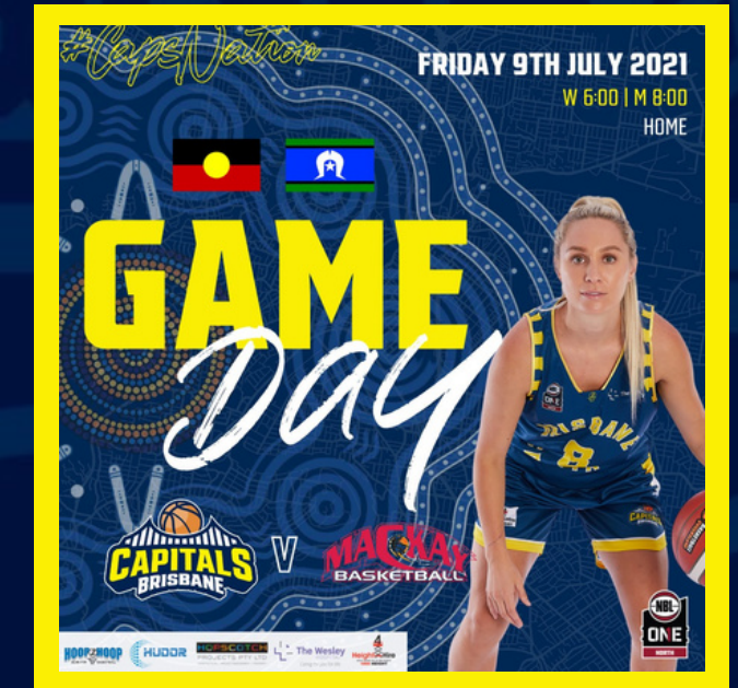
Game Day Posts